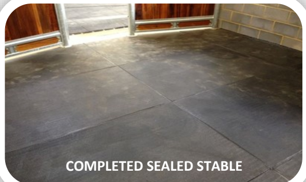
COMPLETED SEALED STABLE