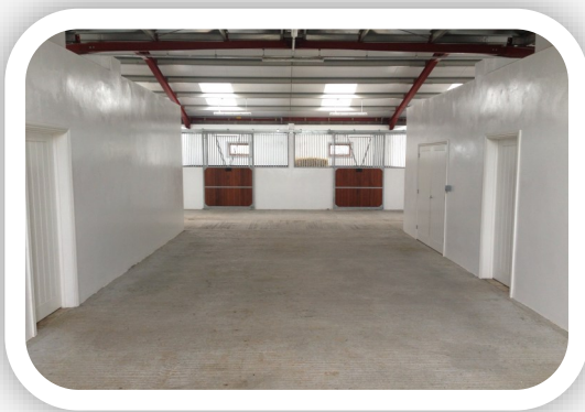
STABLES & STABLE BARN WALLS

LONG TERM WATERPROOF WASHABLE COATING FOR WALLS & ROOFS