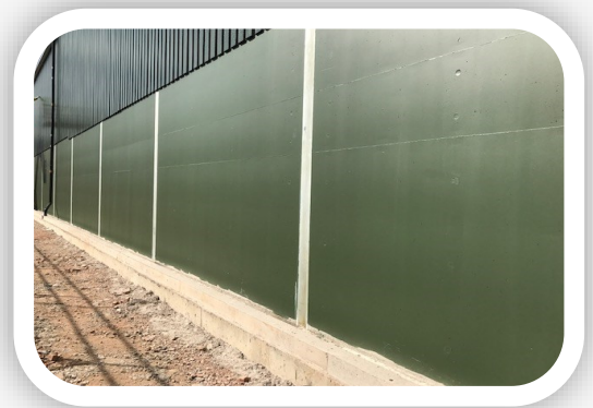
JUNIPER GREEN FOR EXTERNAL WALLS

SEAMLESS ELASTOMERIC NON TOXIC NO FUNGAL GROWTH EASY TO CLEAN HARD WEARING ECONOMICAL LOW ODOUR EASY TO APPLY