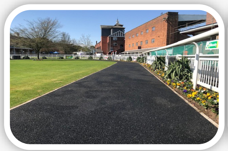
Black EPDM Rubber Granules and Black Stone

Stone Blend can also be used for walkways where grip and safety for human traffic is required