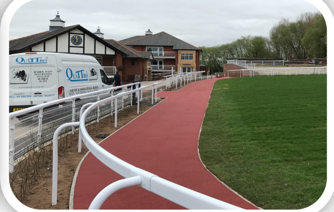
Red EPDM Rubber Granules and Red Stone