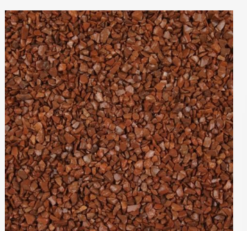
Ideal for Stable Yards, Walkways & Racecourses plus Pedestrian walkways and paths where safety is paramount.