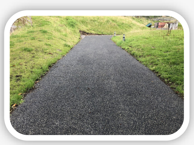
PEARL QUARTZ on WALKWAY