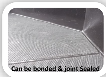
Can be bonded & joint Sealed